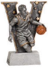
BASKETBALL MALE V802 6" - $11.25 ea. V702 5" - $10.25 ea.