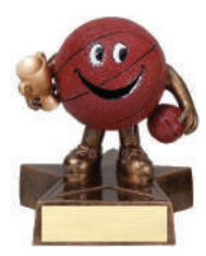
LBR03 4" - $8.95 ea.