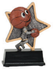
LPR02 5" - $8.50 ea.