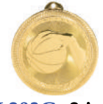
BL203G- 2 inch $7.25 ea.