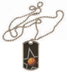
DT102 DTCHAIN1 WITH 32 INCH SILVER METAL NECK CHAIN $7.25