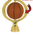
Basketball - SPN91 6" Figure No Column $9.50 2" Column $10.50 4" Column $11.50 6" Column $12.50 8" Column $13.50