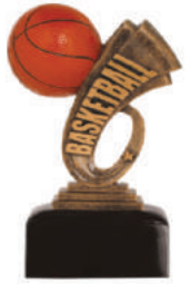
HDL102 HDL202 6" - $10.00 ea. 7" - $11.00 ea.