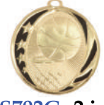
MS702G- 2 inch $7.25 ea.