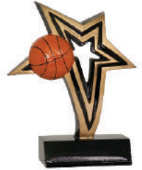
NFR102 NFR202 6" - $10.00 ea. 7" - $11.00 ea.