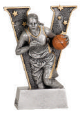
BASKETBALL FEMALE V803 6" - $11.25 ea. V703 5" - $10.25 ea.